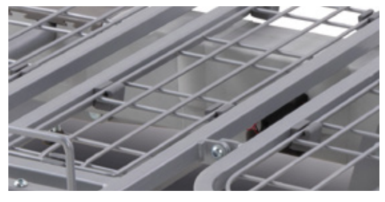
Metal mesh sleeping surface