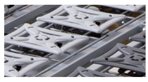
Comfort sleeping surface

As a basic variant, the metal mesh sleeping surface has excellent ventilation properties and enables optimal moisture transfer.