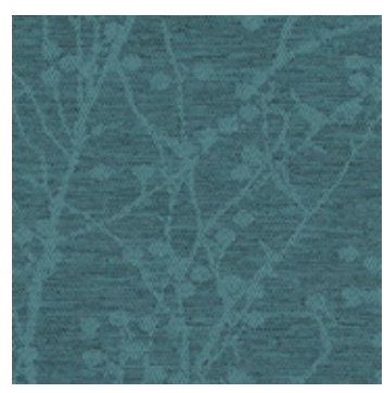
Lake (Blossom structure)