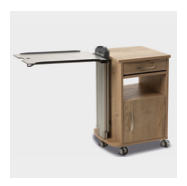
Bedside cabinet WIII