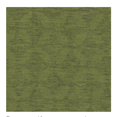
Evergreen (Aspen structure)