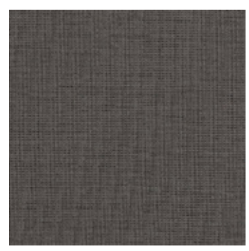
Nutmeg (Cedar structure)

The variety of leather and fabric upholstery makes it possible to design a bed that works with individual room concepts. The samples presented are just a small selection of our extensive collection.