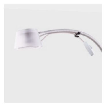
CURA bed light