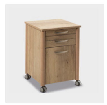
Bedside cabinet WIV